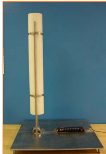
Figure 2- Drop tube apparatus to simulate injury mechanism.