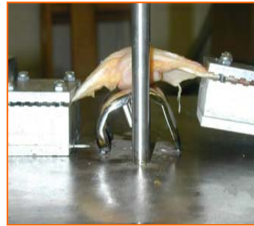
Figure 3 – Patellar component secured with freeze clamps underneath the drop tube apparatus