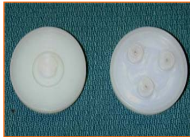
Figure 1- One peg and three peg patellar components with identical conforming surface.

Thirty-four matched pairs of fresh-frozen cadaveric patellae with intact patellar and quadriceps tendons were used in the study. DXA scans were performed to determine bone mineral density of each specimen. One patella from each matched pair was resurfaced with a 1-peg design, and the matching patella was resurfaced with the 3-peg design. Size 35, dome shaped, all-polyethylene Axiom patellar components by Wright Medical were used (figure 1). The components were identical other than the peg design. The un-resurfaced patellae were also tested to provide control values. The direct injury mechanism with a fall on a knee in flexion was simulated (fig 2). The extensor mechanism was secured with freeze clamps under constant reproducible tension (figure 3). A 2.27kg lead weight was released through the drop tube at different heights until fracture was noted using radiographic imaging. Cumulative total energy to failure was calculated as the total sum of the weight multiplied by the drop heights for all drops sustained until fracture of the patella. A paired t-test was used to analyze the data statistically.